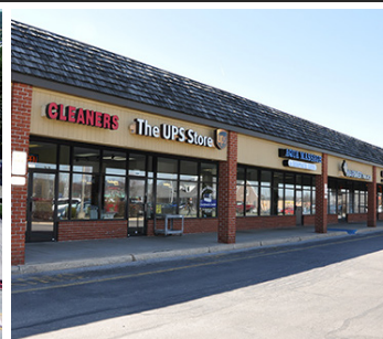
KINGSTON SQUARE York, PA Neighborhood Center 50,000 SF