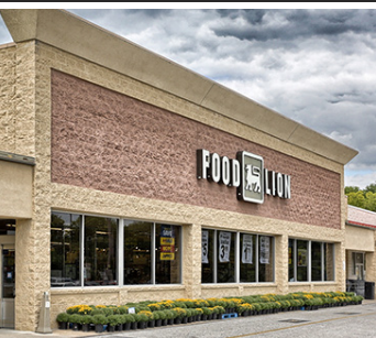
STONYBROOK SC York, PA Grocery Anchored 63,955 SF