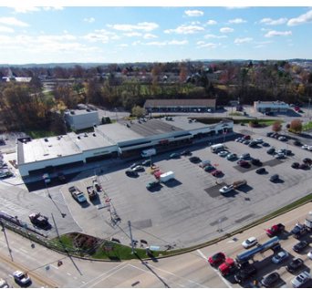
NORTHGATE SC York, PA Grocery Anchored 45,756 SF