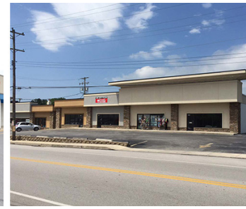
MANCHSTER PLAZA York, PA Neighborhood Center 17,678 SF