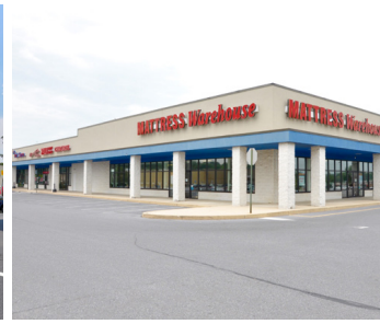
LINCOLN HIGHWAY EAST Chambersburg, PA Grocery Anchored 104,290 SF