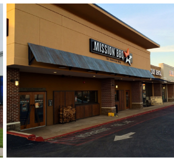
MAPLE VILLAGE York, PA Neighborhood Center 48,550 SF