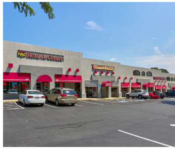
WHEATLAND SHOPPING CENTER Lancaster, PA Neighborhood Center 69,182 SF