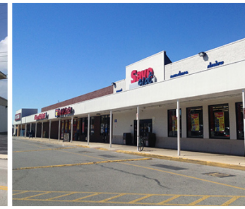
MOUNT ROSE PLAZA York, PA Neighborhood Center 61,500 SF