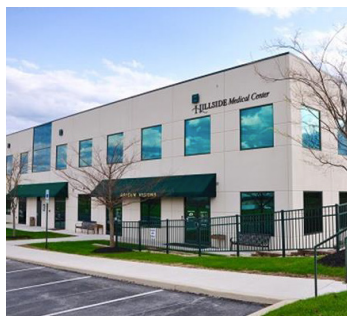
HILLSIDE MEDICAL CENTER Hanover, PA 24 Medical Suites 149,276 SF