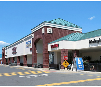
CARLISLE MARKETPLACE Carlisle, PA Grocery Anchored 90,289 SF