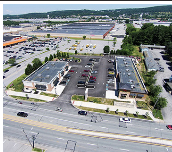
FIREHOUSE SHOPPES York, PA Neighborhood Center 15,680 SF