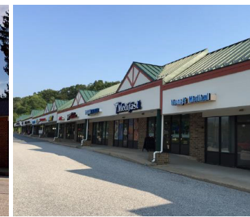
THE HEIGHTS SC York, PA Neighborhood Center 27,000 SF