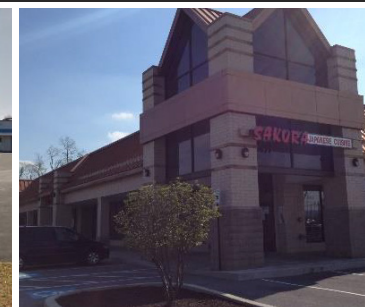
SHOPPES AT SILVER SPRINGS Mechanicsburg, PA Neighborhood Center 50,000 SF