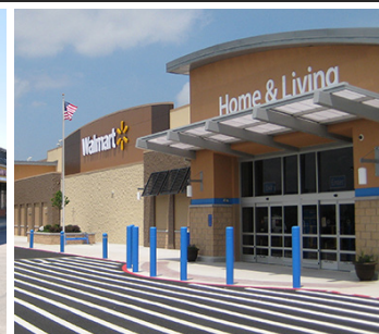
NEWBERRY POINTE Etters, PA Grocery Anchored 43,200 SF