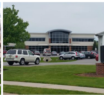
FIRST CAPITAL FEDERAL CREDIT Chambersburg, PA Freestanding Retail All Central PA Locations