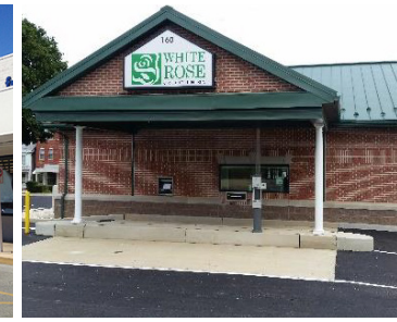
WHITE ROSE CREDIT UNIONS York, PA Freestanding Retail All Central PA Locations